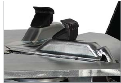
Tried, tested and proven clamps with plastic protection