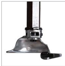
Mount / Demount Tool with plastic protection