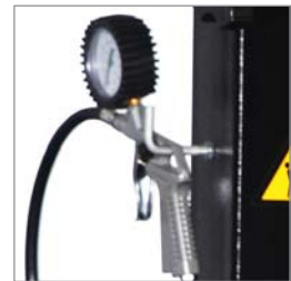
Pressure gauge for inflator